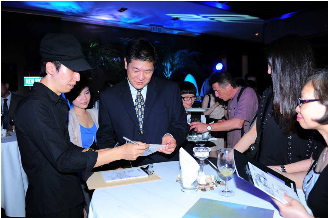
Guests appreciating their NUMI cartoon drawings